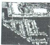
A marina created for the Southampton International Boat Show, UK

People are determined to build a marina at the Gateway of India. But we need to test the feasibility of the area. A marina must have two and half meters of water at low tide to accommodate a yacht's keel. After receiving all necessary permission from the Port Trust of India, carrying out soil testing, environmental impact study and wave study, you need to